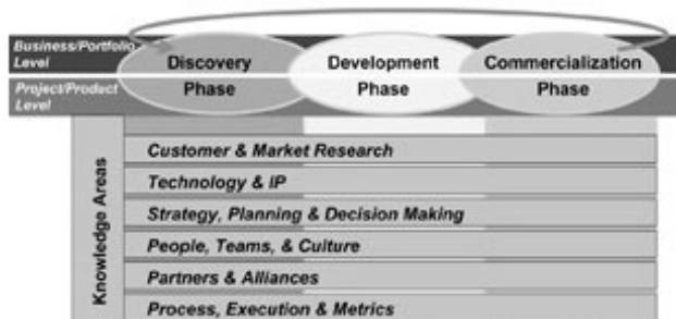
Figure: Absolutely Inc. Product Launch Methodology (source: Product Development and Management Association)

Our product management services draw from proven methodologies from the PDMA and Malcolm Baldrige Award criteria.