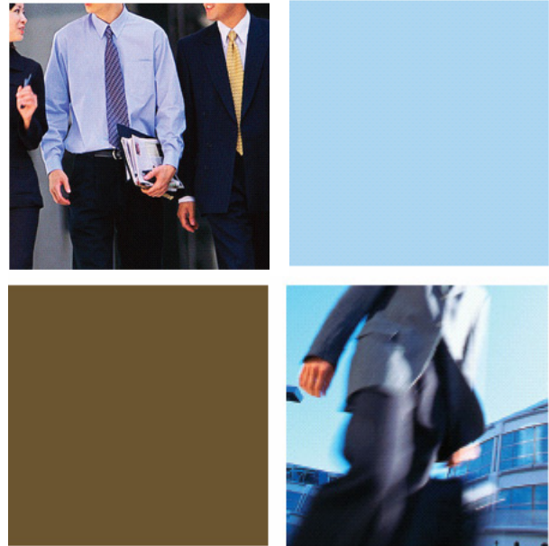
Figure: Absolutely's Services Bridge the Gap between Marketing and Engineering

We specialize in helping emerging technology companies add referenceable, strategic accounts.