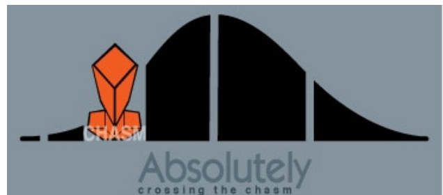
Figure adapted from Geoffrey Moore, Crossing the Chasm

We look forward to contributing to your success.